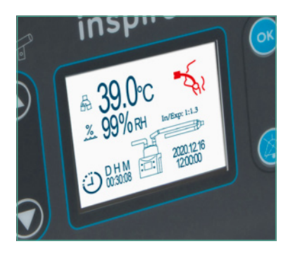
Critical Care • Respiratory Humidifier